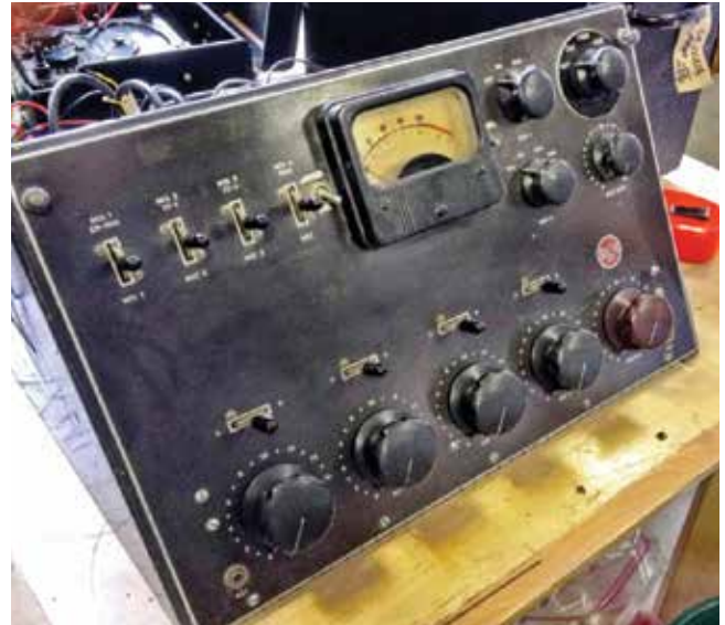
Vintage RCA Console being repaired

This Club is thus a site for meetings, but also of conservation and restoration. Classic units are prepared, fixed or restored according to their needs. These objects are then displayed in the various expositions of the Musée des ondes. The club also takes care of the collections and the acquisitions of the museum. Occasionally they do repairs on equipment from outside the museum in exchange for a monetary contribution to help with the running expenses of the museum.