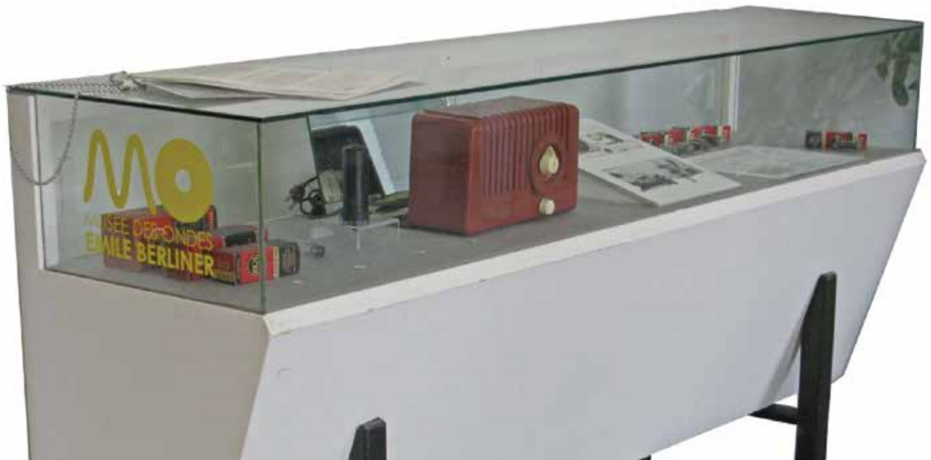
RCA Radio display in the Lacasse Street Entrance

Three other showcases are placed close to our new exhibition space beside the in-house restaurant ZinZin. These exhibition showcases will focus on Emile Berliner and his many different international and social endeavours. Other showcases are close to the elevators over the four floors on the Lacasse Street side, with one showcase on each floor. These will exhibit the relationship between Montreal's music scene and the evolution of equipment for music reproduction.