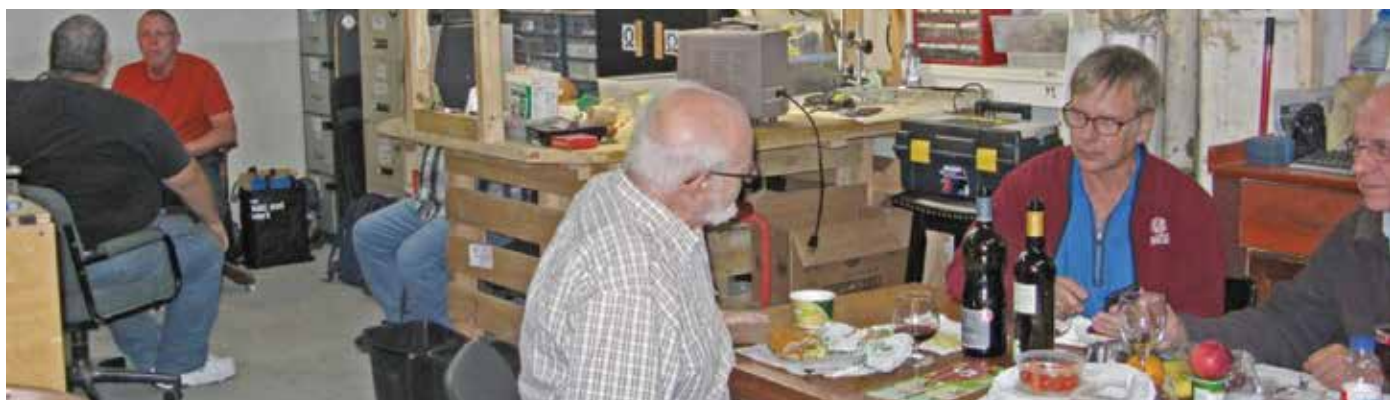
Lunch break for the "tubes"